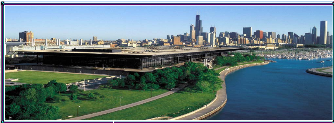
Lakeside Center – Chicago

Watch for further details in the Registration Brochure that will be mailed in August. See you in Chicago next January.