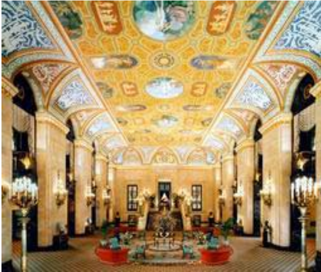
Palmer House Hilton Chicago

The Local Arrangements Committee is excited about sharing the richness of our city with you! By August you should receive the Registration Brochure for the January 2003 ATFE Biennial Consultation. But you do not have to wait until then to book your rooms. You can reserve your rooms at the Palmer House Hilton now!! Simply call 312/726-7500, identify our meeting, The Association for Theological Field Education, January 22-26, 2003. Room rates are $125 per night.